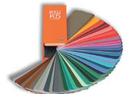
RAL colour of your choice at no extra charge